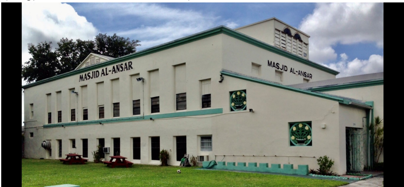
Figure 4: Masjid al-Ansar, the first mosque in Florida that the foundation placed on the National Register of Historic Places

These two accomplishments, viewed together, are strategically complementary and serve to validate the foundation's entire operational model. The NEH grant affirms its elite academic credentials and its relevance to the national story. The mosque preservation project confirms its effectiveness as a grassroots advocate and its commitment to delivering real-world victories for local communities. This dual impact demonstrates that The East West Foundation is neither a remote ivory tower think tank nor a conventional service provider. It is a dynamic hybrid, and its power lies in the synergy between these two modes of operation.