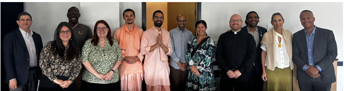
Figure 5: MOSAIC Interfaith Clergy Dialogue Meeting at Florida International University

Please begin this dialogue by visiting the foundation's home on the web at theeastwestfoundation.org