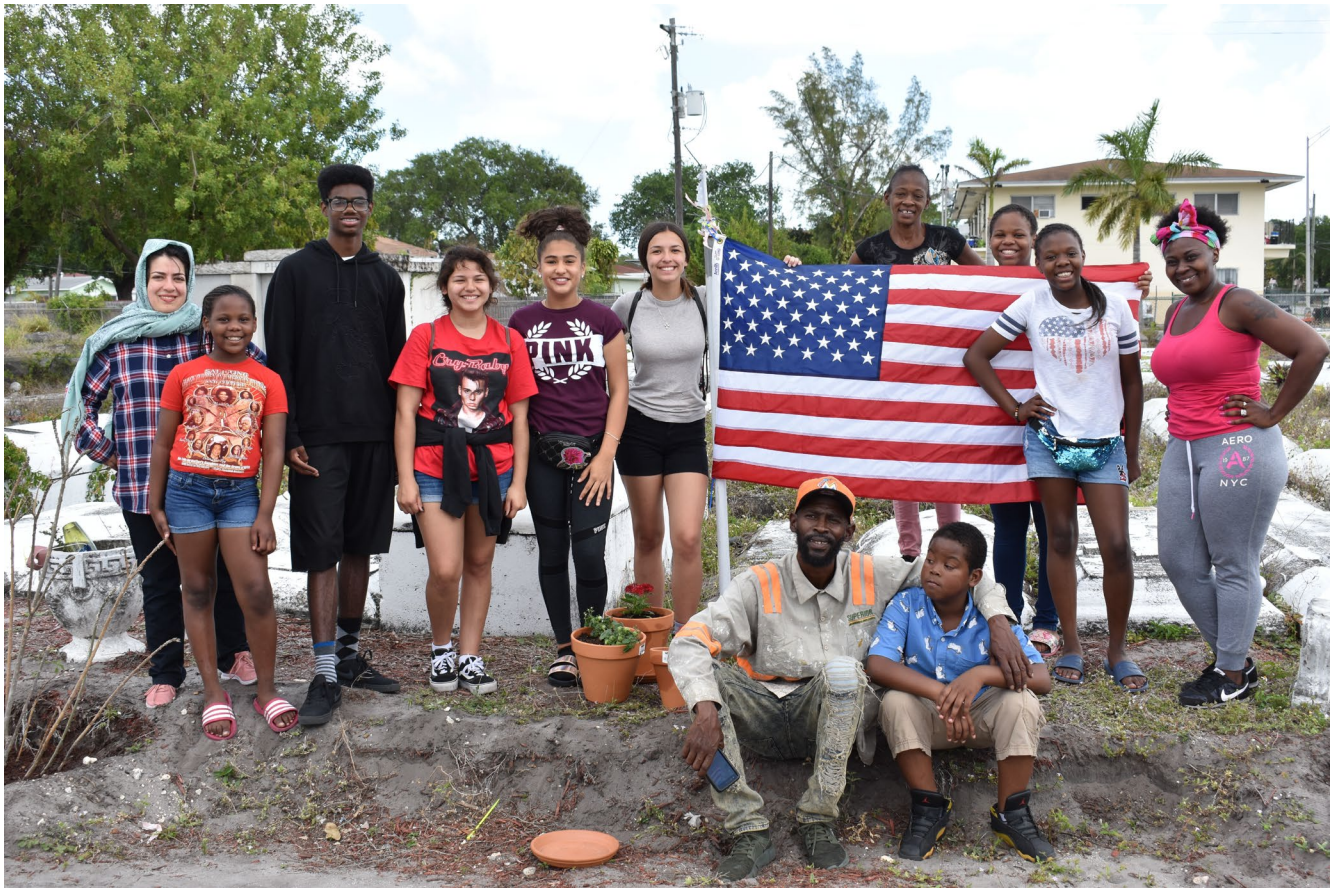
Figure 1: Brownsville's first community garden was established by the foundation

The East West Foundation was established in 2017 not from a detached theoretical perspective, but from a direct and deeply felt observation of lived reality. Its founders, a dedicated group of scholar-practitioners, were moved to action by the persistent and systemic inequalities they witnessed affecting the historically Black community in Brownsville. They saw firsthand how entrenched challenges restricted opportunities for residents to flourish, creating barriers that disproportionately impacted the community's children. This experience forged the foundation's fundamental purpose: to serve as a conduit for positive change by translating complex global and historical forces into actionable, localized strategies that empower a community to thrive. 1 The mission became one of narrating the stories that are too frequently overlooked, cultivating understanding in situations fraught with division, and ultimately equipping the community with the tools and resources needed for self-determination and prosperity.